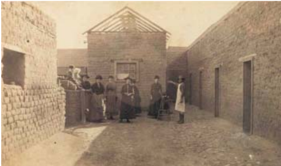
Ladies and cook in Zaguan, circa 1890.