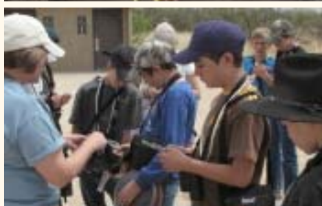
Legacy Day 2011

Join Us For Our 11th Annual Roundup & Open House!