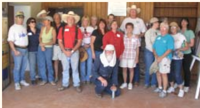
June 18 volunteers

Tasks completed that day included cleaning of rooms in the Ranch House; treatment of wood for the corral repairs project; repair of the timeline display; painting the Dining Room; continued patching of the Middle Room walls and ceiling plaster; and trimming bushes and grasses away