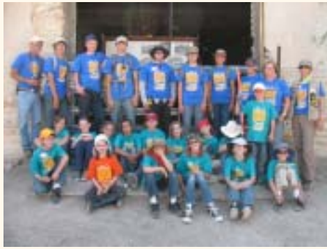
WATG! Nature Heritage Discovery Camp participants