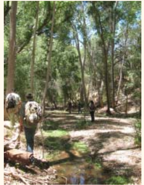
WATG! Teen Stewards hike Cienega Creek

delicate balance of the natural wetlands. They practiced roping a "dummy" cow, adobe-brick making, and making their own bandana using native grasses and the brands of the Empire Ranch. Families joined the fun in an ice cream social with pioneer cobbler from the Vail Preservation Society's Territorial Kitchen Exhibit.