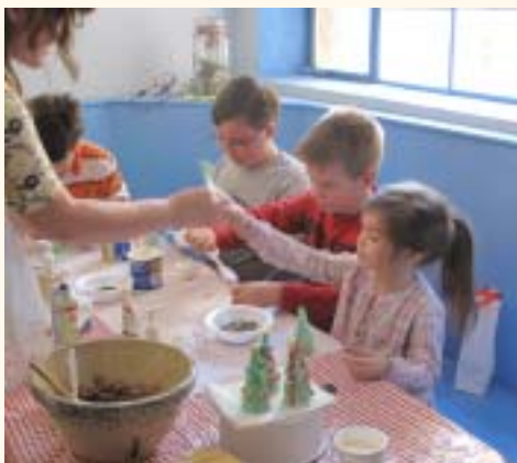
Vail family reenactors greeted visitors for Christmas tea, cookies, and singing (top); cookie-making and crafts made great fun for kids