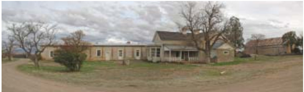
Empire Ranch and Adobe Haybarn viewed from the West, 2004

Of course, there will be food for purchase, free parking, and much to see and do. More details will appear in the August Newsletter. Put it on your calendar today! Saturday, September 30, 2006, 10:00 a.m. to 4:30 p.m.