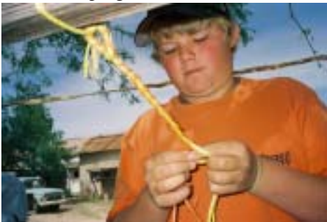
Legacy Day, 2005.

Looking beyond Legacy Day, plans are underway for a new pilot education program for local youths. Selected students will be able to attend a hands-on education program this summer in coordination with the BLM. The program is planned for a five-day schedule at the ranch headquarters. An educational grant, applied for through the BLM, will provide partial financial support. More information will follow as the program unfolds.