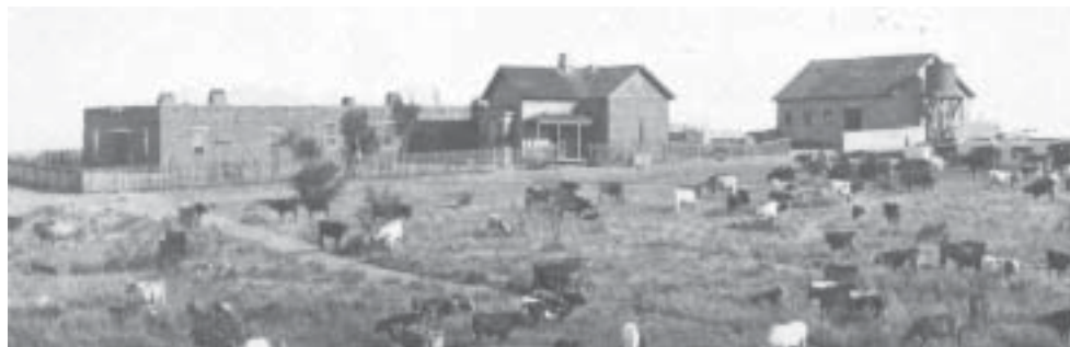
Empire Ranch and Adobe Haybarn viewed from the West, c. 1880