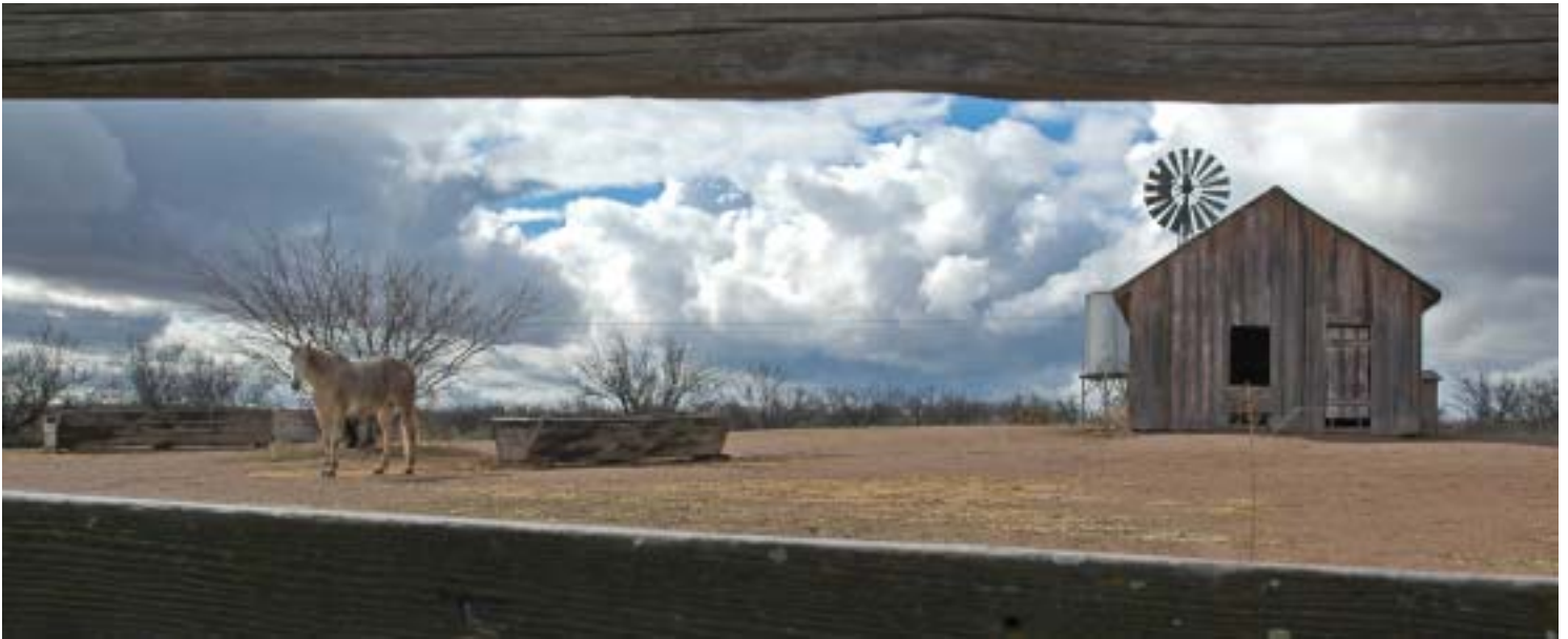
South Barn, viewed here from corral west of Adobe Haybarn.