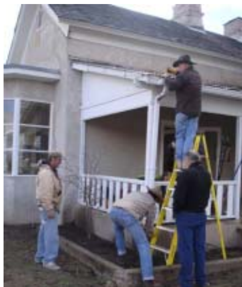
Volunteers pitching in on February 16 volunteer work day.

Working together we stabilized the West Gable and walls of the Victorian Ad- (continued on p. 2)