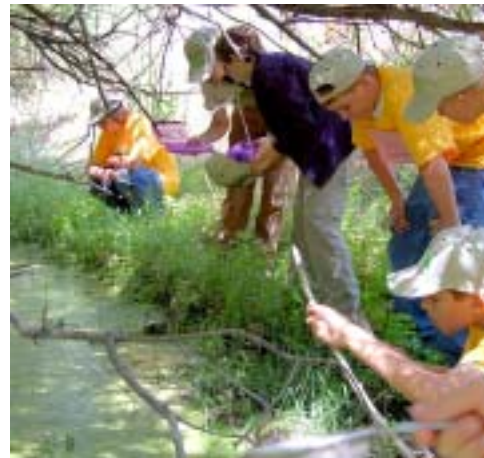
Grasslanders researching Cienega Creek, June 2007.

Attendees will enjoy playing the role of "naturalists" as they work together with master teachers, scientists, and land managers to monitor the water, vegetation, and wildlife unique to Las Cienegas National Conservation Area. They will explore the value of the historical buildings and landscapes. Local ranchers will share the legendary history and stories of cattle ranching at the Ranch. Historical preservation-