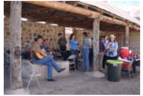
Guests listening and relaxing in shade of Stone Corral after tour.