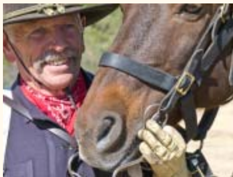
This issue includes a selection of Roundup photos contributed by C. Auerbach, T. Holland, and L. Gregory.

End-of-year assets totaled $155K, comprising $28.6K in BLM grant funds (fully obligated); $2.3K in ERF restricted funds for education; $28.4K in the Vail endowment and ERF restricted funds for repairs; $22.5K in ERF unrestricted funds obligated for preservation; and $73.2K in ERF unrestricted unobligated funds.