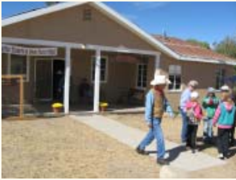
New Visitor Contact Center ready for the Roundup.