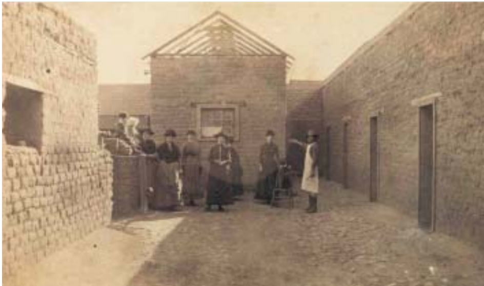
Ladies and cook in Zagan, circa 1890.