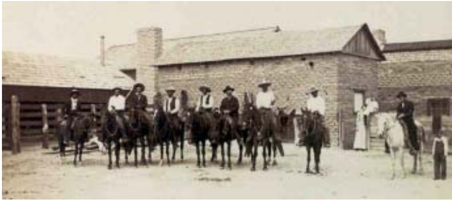
Empire Ranch Vaqueros circa 1890