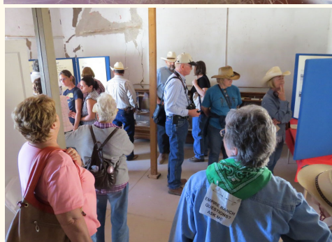
2013 Roundup moments