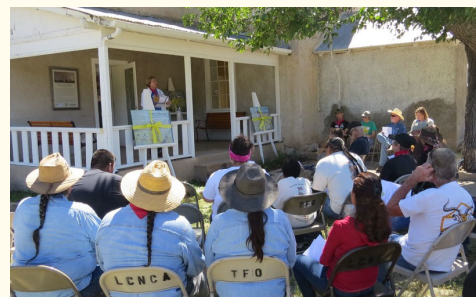
Ribbon cutting event for WATG student alumni's new visitor information signs

As always, we are so grateful for the support of the Bureau of Land Management and our presenters and volunteers who contribute thousands of hours each year. Lastly, this event would not be possible without the financial support of our Roundup sponsors, underwriters, and auction donors listed below.