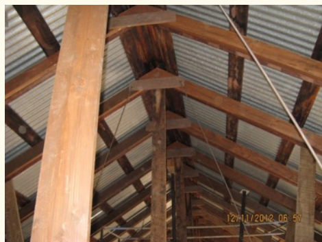
Stabilizing Adobe Haybarn roof

Work on foundations and surrounding soils has started along the barn's south wall. Following the removal of old concrete patching along the interior base of the walls, loose soil and deteriorated adobe masonry are removed down to solid, compact soil. The excavated areas