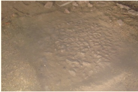
Section of cobbled floor in the Adobe Haybarn

Once the foundation work is completed the steel framework (or "diaphragm") will be attached to the adobe walls, and diagonal elements added for greater stability. When completed, hopefully by the end of April, the Adobe Haybarn will be structurally sound, and safe for use by ERF and BLM for public events.