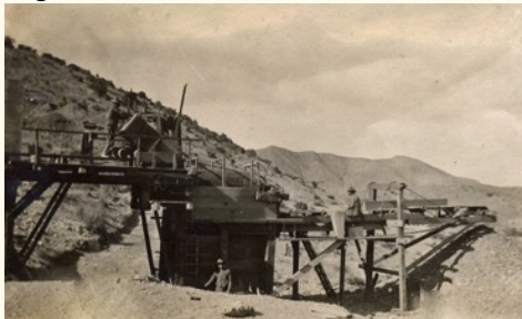
Mine scaffolding and ore transport car, ca 1883