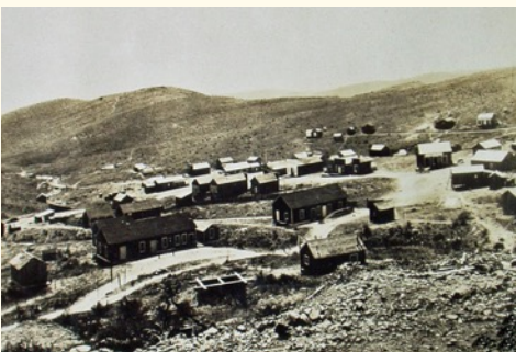
Total Wreck Mining Camp, ca.1883

Walter’s brother, Edward Vail, became the assayer and superintendent of the Total Wreck, which included its own crushing mill. Water for the mill, which was fully operational by early 1883, was pumped from the Cienega Creek. The