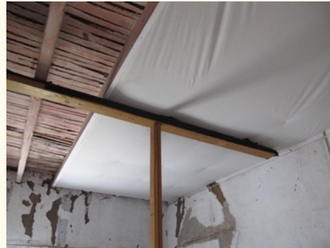
Manta installation in process (above), and completed (below).

The preservation update in the last ERF News mentioned the installation by volunteers of a muslin manta across part of the ceiling in the Ranch House Room 6. Mantas were commonly used in adobe structures with earthen roofs to protect occupants from falling dirt from the roof. There is no historical evidence that a manta was ever used in this room, but other Ranch House rooms do have evidence of manta use. This manta was added to protect the Cowboy Life exhibit, especially the Hibbard, Spencer, Bartlett & Co. display case, from dirt which filters down from the original earthen roof above the ceiling boards.