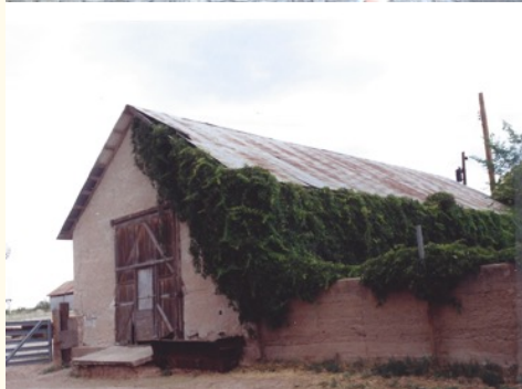
Low visibility supports and repairs completed to stabilize Haybarn roof & walls (top); barn exterior as it appeared in 1994 (bottom).