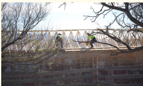
Stages in roofing and strengthening the feed barn.