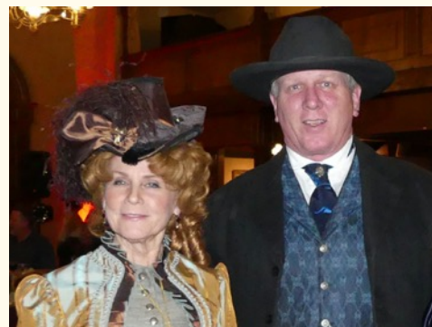
Steampunk dancers, gamblers, and strutters fully enjoyed the night.