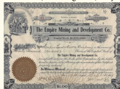
Empire Mining and Development Co. stock certificate, dated September 17, 1907.

The branding log lists, by date, cowboy, and ranch location, the number of calves and colts branded. A handwritten log tally reveals that from 1907 to 1928 (the year the ranch was sold to the Boice family) a total of 94,599 calves & colts were branded, an average of 4,500/year.