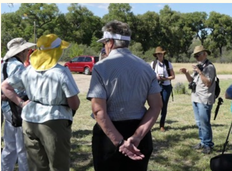
Photography advice from Frank Gohlke grabbed the group's attention.

Another docent-led tour preceded the final event of the day—a Landscape Photography workshop led by Frank Gohlke, a University of Arizona photography professor and famous landscape photographer. Everyone left the Ranch engaged, enthralled and excited!