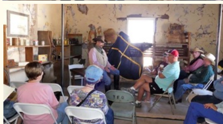
Roundup highlights