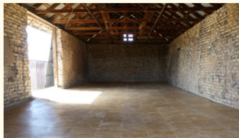
Temporary protective flooring for stabilized Adobe Haybarn.

The Ranch House stabilization will include reinforcing the foundations in several areas; securing the tops of the walls for structural strength; repairing interior and exterior wall surfaces; replacing the roof on the Victorian Addition; rehabilitating the Children's Addition to make it safe for visitors; and contouring work around the house to improve drainage.