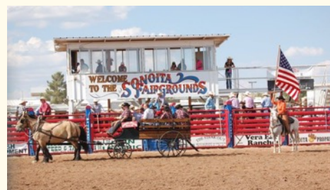
Boice Family at Sonoita Rodeo