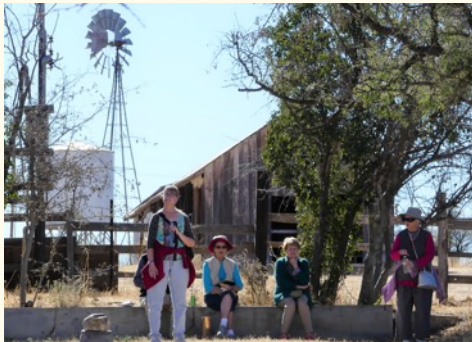
Adobe Haybarn interior (above) and north view of South Barn and windmill (below) .