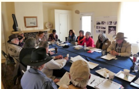
ERF Board convened for orientation meeting in January

The following officers and members of the Board of Directors were elected at the November 19, 2016, board meeting.