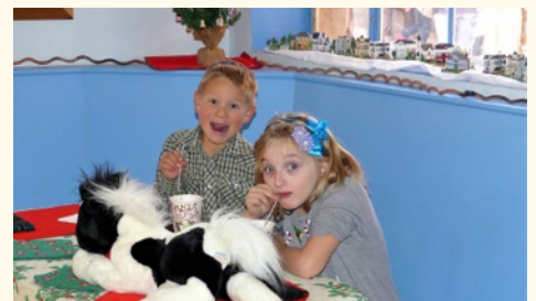
Cowboy Christmas visitors freely toured, visited, and munched.