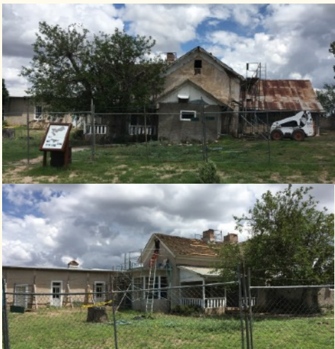
Ranch house reconstruction moves forward protected behind a 6-foot wire fence

Although the Sawmill fire in late April interrupted progress on Headquarters projects, work resumed as soon as it was safe to do so. At the Ranch House structural improvements have been made where the roof framework meets the tops of the walls in the Victorian Addition, the Ranch Manager's Quarters, and Pantry. Clay-rich dirt, quarried from a site used for previous material, was cast into replacement adobe bricks which are now curing in the area of the former swimming pool.