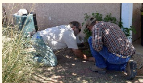
Tack Room organizing & irrigation system maintenance were among volunteers' accomplishments.

specting and tightening the brake on the windmill; and a cleaning of the Cowboy Life exhibit, which is now located in Adobe Haybarn during construction. Work on August 19th focused on mowing and weeding. The record rains this summer provided plenty of tasks for everyone.