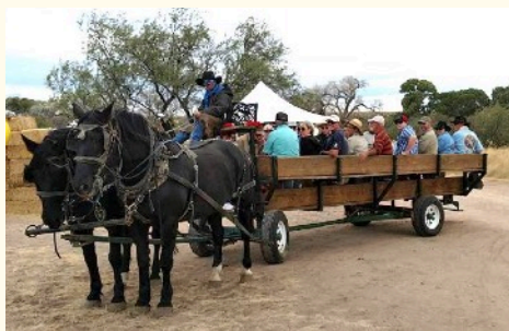
Handy wagon rides roll between parking and the Roundup.