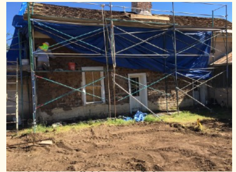
Worker on scaffolding (top left) repairs Victorian Addition's south wall adobe

Behind the chain-link construction fence that temporarily surrounds the Ranch House, contractor Statistical Research, Inc., has made progress on several components of this stabilization project. Current work includes construction of the roof-wall connection system; preparations to build supporting walls under the floor of the Children's Addition; and repairs to the adobe walls of the east and west walls of the original 4-room E.N. Fish house and Rear Addition and the south wall of the Victorian Addition.