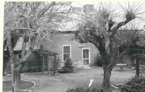
Flower bed (far left) and garden south of the Ranch House Victorian Addition about 1950.