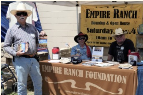
ERF booths at Patagonia Fall Festival (above) and Sonoita Rodeo (below)