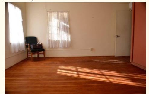
Restored Huachuca House floor

Volunteers at the August workday concentrated on mowing, corral repairs, and clearing one of the bedrooms in the Huachuca House to make it ready for an Eagle Scout project. Jacob Abelowitz, Troop 774–Tucson, led a team who removed an old carpet and repaired and refinished the beautiful wood floor underneath. The October volunteer workday focused on preparing the Headquarters for the Roundup. Plan to join us for the 2018 volunteer workdays, starting on February 17th.