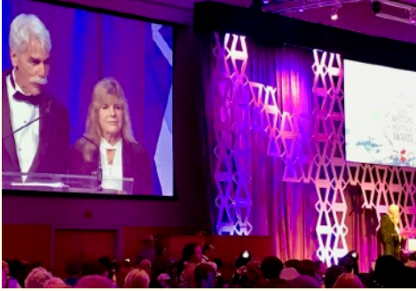
Motion picture celebrities Sam Elliot and Katherine Ross hosted the awards banquet.