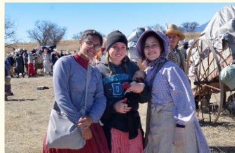
Youth pull handcart to ER Headquarters (top); young pioneers in period clothing.

The trek re-enactment allows participants to experience the hardships and challenges encountered by their ancestors. Dressed in period clothing the youth pulled handcarts between four LCNCA locations (Cieneguita, Ag Fields, Airstrip, and Empire Ranch Headquarters) traveling more than 23 miles on foot and camping in below freezing temperatures. The trek ended at Empire Ranch Headquarters where they added cement blocks carried in the handcarts to build a "temple" structure. They were greeted with cheers and applause from their enthusiastic families and friends and enjoyed in a celebratory lunch before returning home.