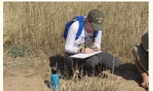
YES! participants discussing fire damage (above), monitoring Sacaton erosion (below), working at Bill's Pond (lower left)