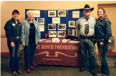
ERF outreach volunteer at Canoa Ranch Anza Days (top) and Rio Bravo screening (bottom)