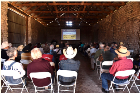
Guests enjoying remarks in house corral, refreshments in Stone Corral, and talk in Adobe Haybarn.