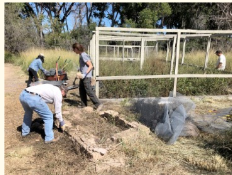
National Public Lands Day volunteers pitch in