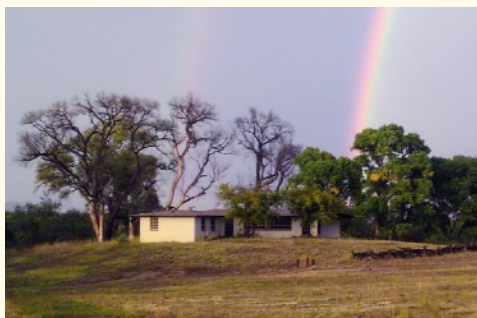
New Ranch House constructed on the Empire in 1950s

The New Ranch House is located in the shade of majestic cottonwoods, north of the Empire Ranch House, on a hill that overlooks the Empire Gulch. In December 2018 the Foundation sent a letter to the Bureau of Land Management indicating the Board's intent to work with BLM to rehabilitate the New Ranch House to make it to be safe and useable. The Foundation is committed to raising $350,000 for this project.