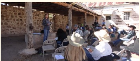
Biological Planning meetings 2012, 2014, 2015