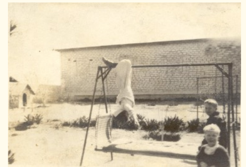
Jungle gym fun, Dusty, Tom and Bill Vail, 1923

"What we did mostly was play robber and cops, games of that type. So we'd be busying ourselves climbing up in the trees, and then you'd climb from the tree onto the rooftop, and across the roof, and, you know, crazy stuff—unless you were riding. And if you were riding by yourself, you'd play games on horse-