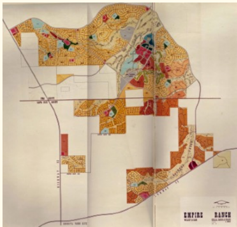
Wilsey & Ham, Cella, Barr, & Evans (architectural firms). Map of proposed GAC real estate development of the Empire Ranch.

Concerns about the project surfaced at the first P&Z Commission meeting, and GAC was required to provide additional information. GAC’s Empire Ranch area