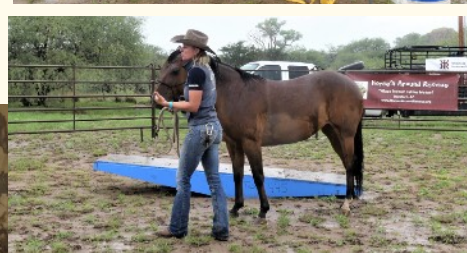
Day of the Cowboy moments