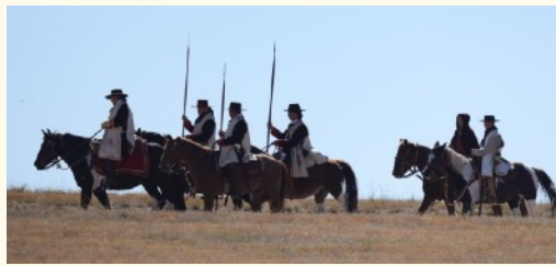
Tumacacori National Historical Park & Juan Bautista de Anza National Historic Trail Mounted Color Guard riding in from Hwy 83.