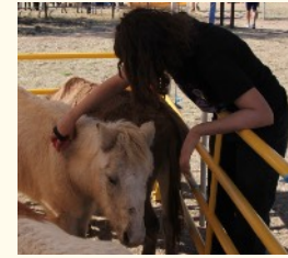
Plenty to see and do for all! Photo credits below left.