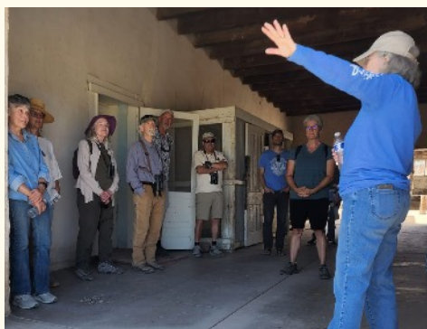
Ranch house tour

ERF was pleased to host the morning session which began with 3 tours at the Empire Gulch (birds and restoration) and the Empire Ranch House docent-led