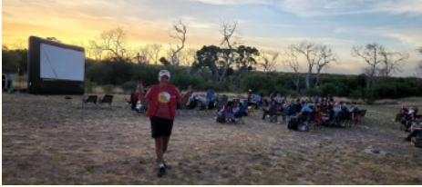
The audience settles in...

The film was shown in the open field northwest of the Empire Ranch House where there was plenty of room to set up groupings of folding chairs. Many brought their own picnic dinner or enjoyed the fare served by EZ Cattle Company Cow Camp Café & Chuckwagon. Many bags of free popcorn dished up by ERF volunteers were consumed.