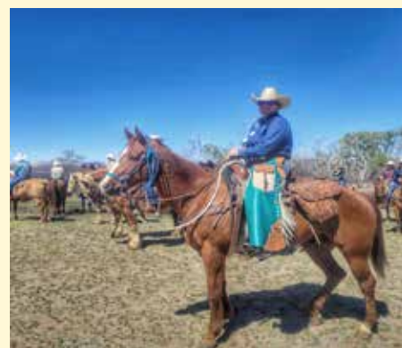
Lots of smiling faces at the 2023 Spring Trail Ride.