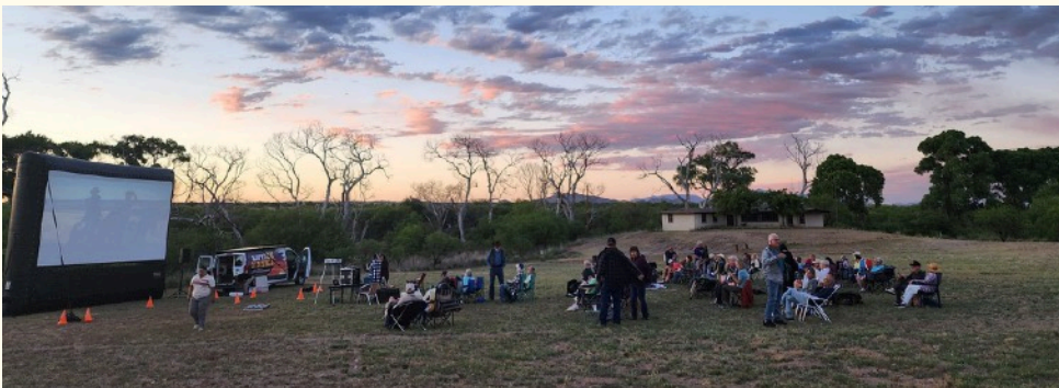
The show begins as the sky darkens...