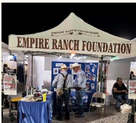
Local events and gatherings are great places to increase public awareness of the Empire.